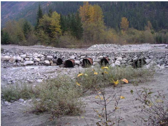
Photo 4: What's wrong or perchance what's right with this picture?